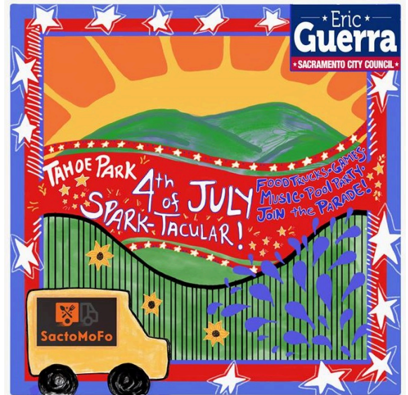
4th of July Spark-Tacular

Become a member of TPNA - $10/year – Join today!