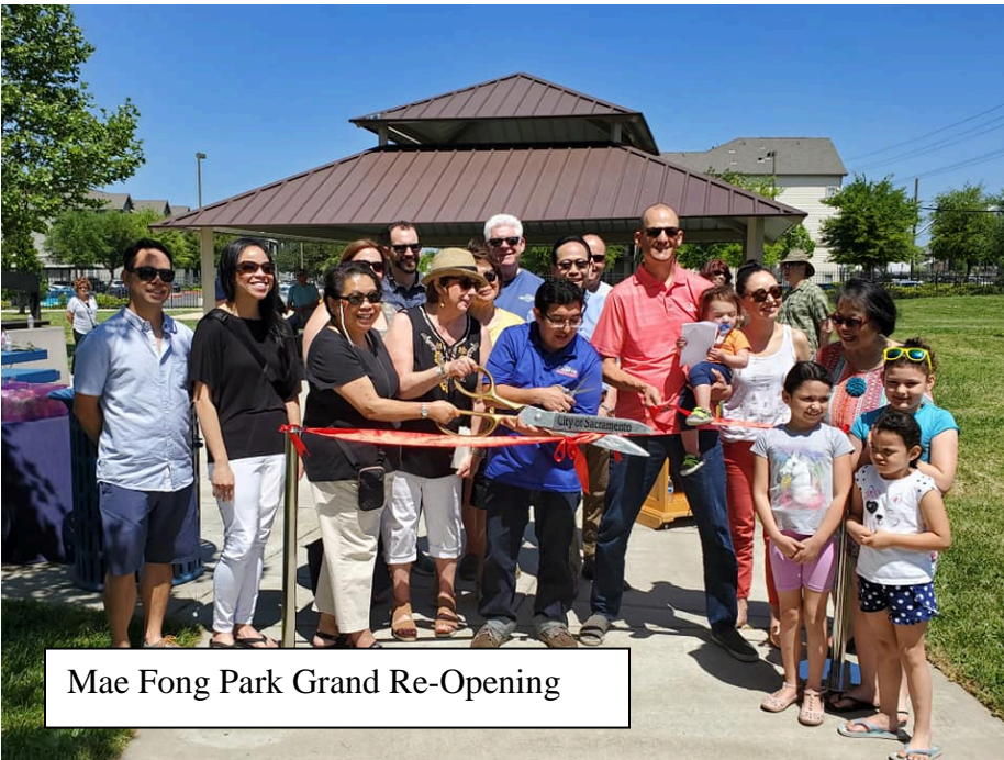
Mae Fong Park Grand Re-Opening