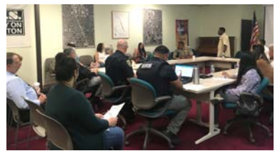
Safety on Stockton Mtg