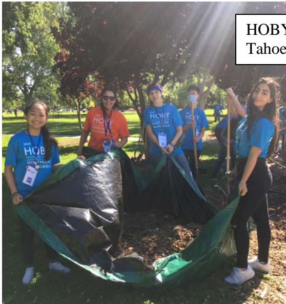
HOBY Youth Leadership Tahoe Park Clean Up