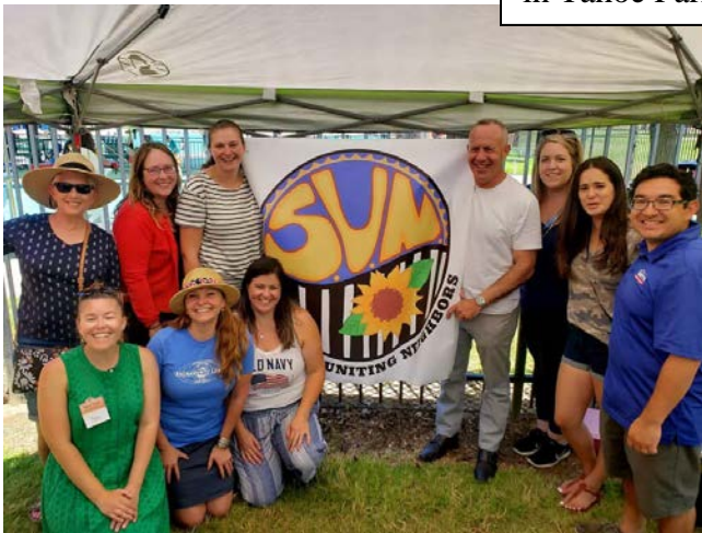
4 th of July Spark-tacular in Tahoe Park